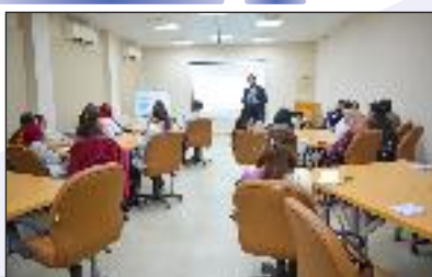
Workshop on Protocol Writing by Publication Department