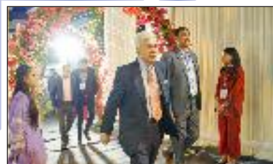
Proceeding to Inauguration Dinner