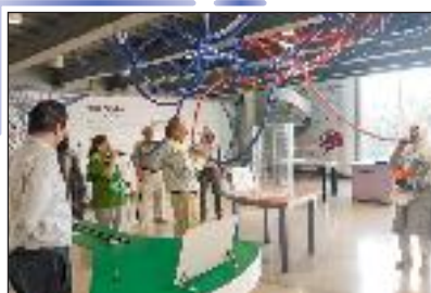
Senior citizens interacting with an exhibition project on noise pollution, exploring its effects through hands-on displays