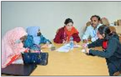
Activity during Workshop Organized by Mental Health Department