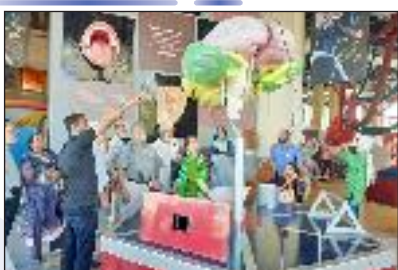
A facilitator explaining the functions of the brain to a group of senior citizens, engaging them with clear and informative visuals