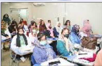
Medical Technology Session