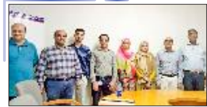
Mental Health Awareness Session by LNH Team at Toyota Motors Head Office