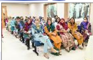
Family Medicine Session