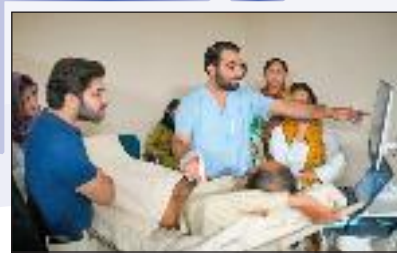
Internal Medicine (Critical Care) Department