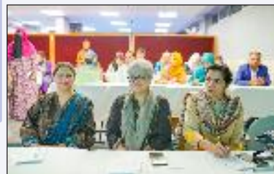
Speakers of Microbiology Laboratory Workshop

Focusing on skills advancement of medical technologists in PEEP titration, renal replacement therapy, cardiopulmonary resuscitation, laparoscopic surgery, and minimally invasive techniques.