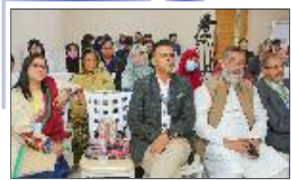
Paediatric Surgery Session