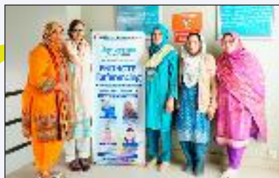
Community Medicine Department Workshop