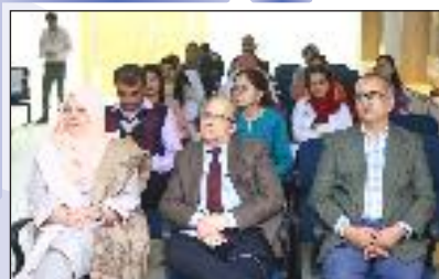
Workshop by Cardiology Department