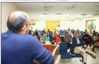
Department of Occupational Therapy Workshop