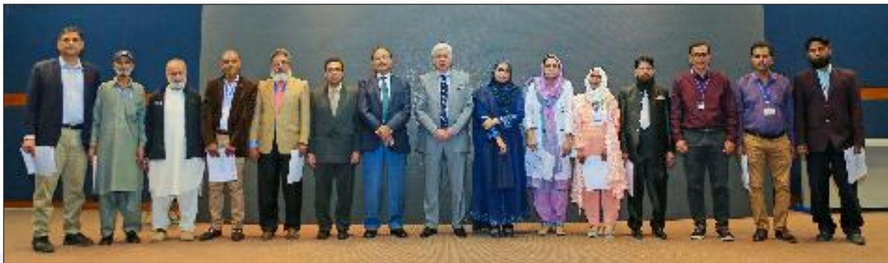
Long Service Award Ceremony (30-40 years)

Departmental Appreciation Awards: The LNH management awarded outstanding achievements of various clinical and administrative departments, who have demonstrated exceptional innovation and excellence in their respective fields.