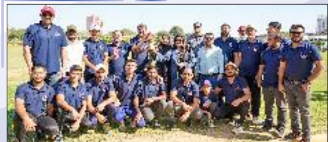
The winning team LNH XI