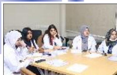
Participants Listening to Lecture at Internal Medicine Workshop