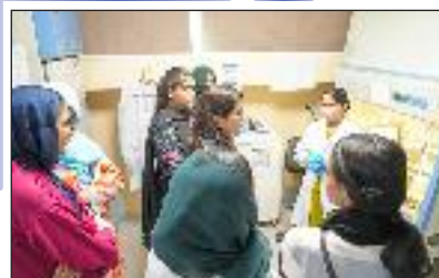
A Demonstration by Molecular Pathology Department during Workshop