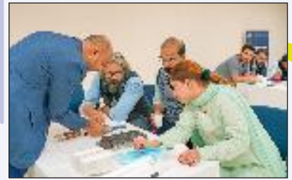
Activity during Workshop by Plastic Surgery Department