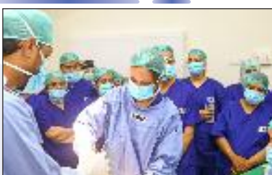
Live Surgery Total Laparoscopic Hysterectomy at Gynae and Obstetrics Workshop