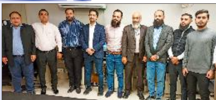
Group photo of TrendMicro, Super Secure Net, and LNH Teams celebrating the successful completion of the Trend Micro Vision One (XDR) and Email Gateway Security implementation project

This accomplishment stands as a testament to LNH's focus on delivering advanced, secure, and innovative IT solutions to meet the challenges of the future.