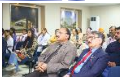
Workshop by Food and Nutrition Department