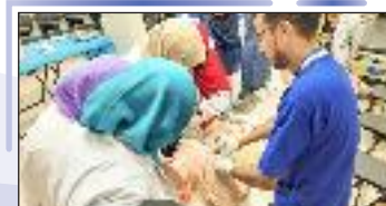
Demonstrations in progress