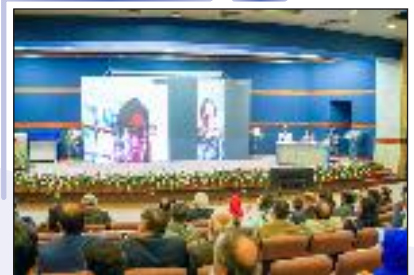
Glimpses from the Video Conference