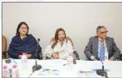
Ethical Review Session