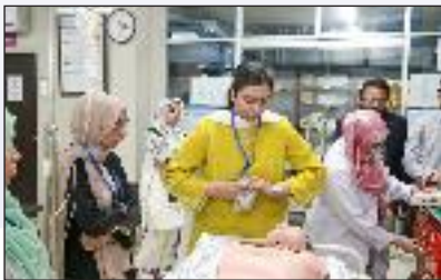
Demonstration Performed by Accidents and Emergency Department