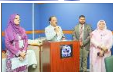
Forensic Medicine Session