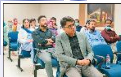
Participants during Internal Medicine (ID) Workshop