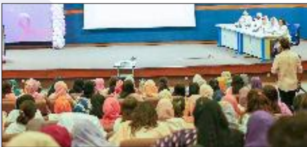
Audience listening to speakers presenting valuable information