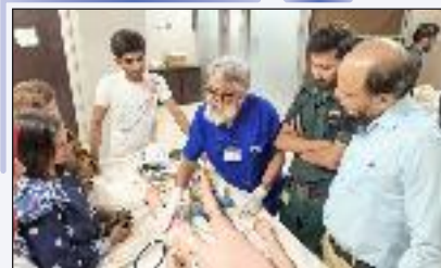
Mass Casualty Workshop