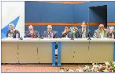
General Surgery Session