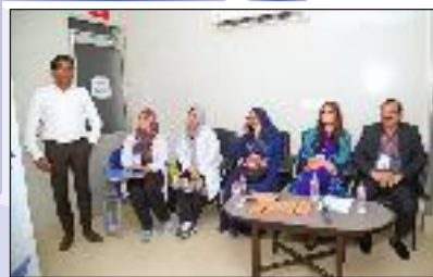
Vascular Surgery Session