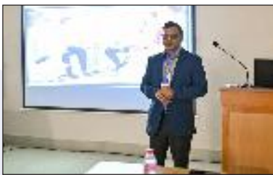
Quality Assurance Session