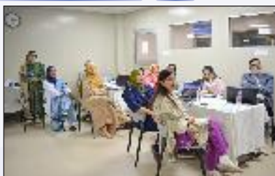
Participants at Anatomy Department Workshop