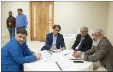
Faculty Members of Gastroenterology Department at Workshop