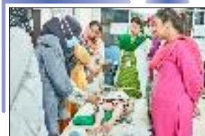
AHA Accredited Courses