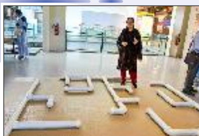
An elderly participant preparing to walk blindfolded, carefully following instructions from a fellow member for guidance and improving sensory and motor functioning