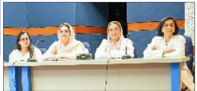
Esteemed panelists responding to queries of the audience