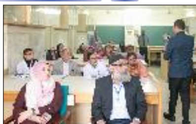
Pharmacology Department Organized a Workshop