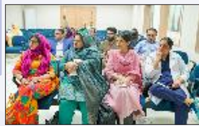
Grant Writing Workshop Participants