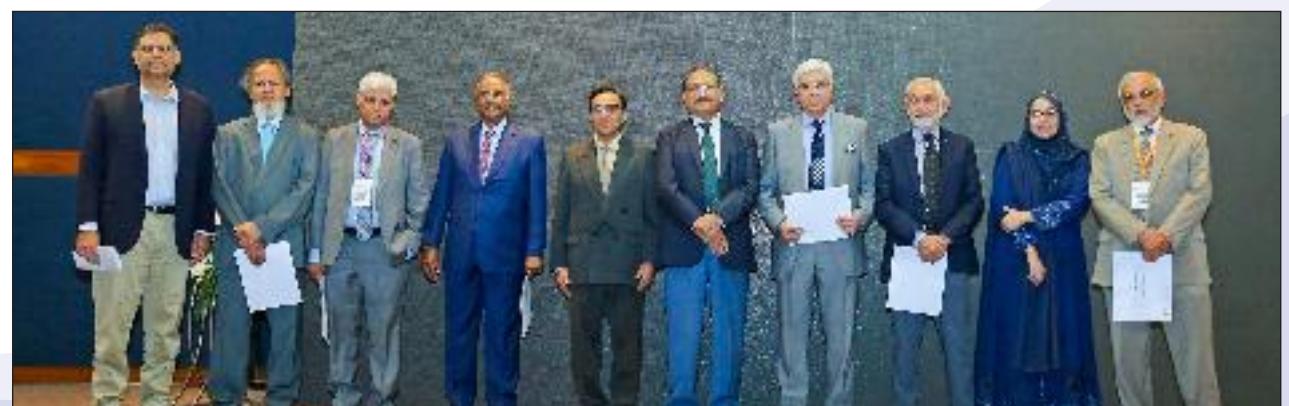
Long Service Award Ceremony (30-40 years)