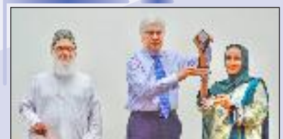
Oral presentation winner