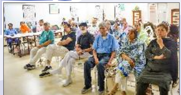
Geriatric Health Camp participants attentively listening to life challenges