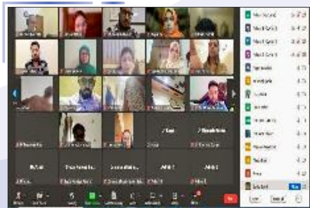
Participants of Course in Zoom Session

This comprehensive program equipped healthcare professionals with practical skills and knowledge for managing various medical conditions. Participants gained expertise in recognizing symptoms, initiating evidence-based treatment plans, and determining appropriate referrals for thyroid disorders, hematological diseases,