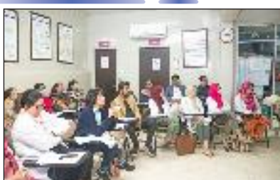
Attendees at Workshop Organized by QA Department