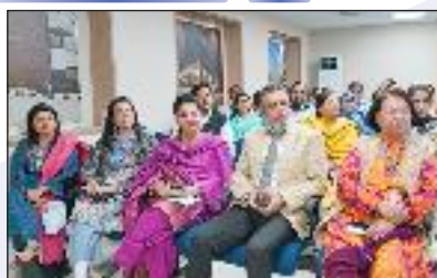
Workshop by College of Nursing