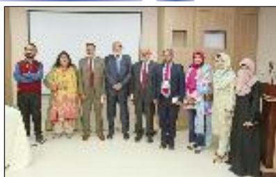
Mental Health Session