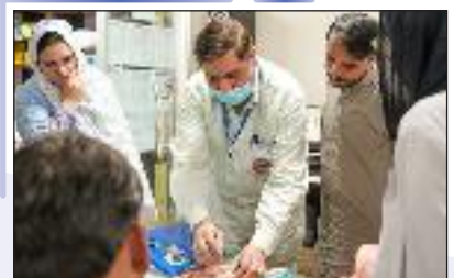
Demonstratoin at Oncology Workshop

and intra-articular injection techniques, PRP and micro-needling, CRRT, ECG and echocardiography, and suicide risk assessment and prevention.