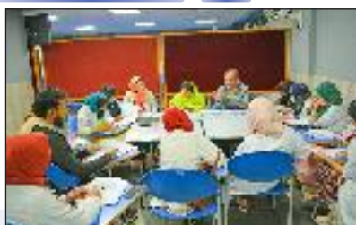
Activity at the Paediatrics Medicine Workshop