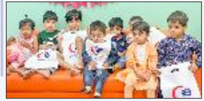
Children's Day Celebration at LNH