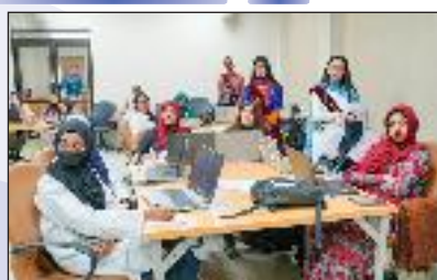
Attendees at the Physiotherapy Workshop