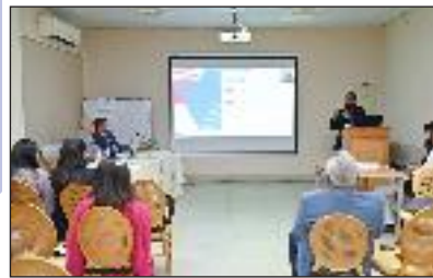
Thoracic Surgery Session