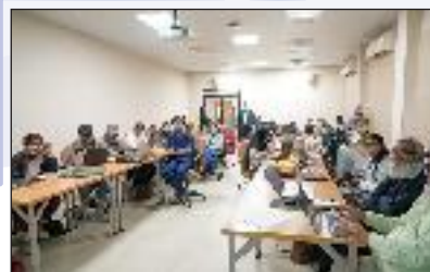
Workshop Organized by Statistics Department