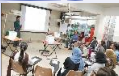
Workshop by Cardiac Surgery Department