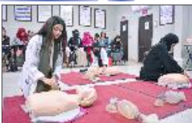
Hands-On Activity at the Medical Technology Workshop