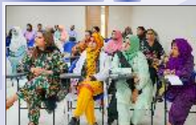
Workshop by Speech Therapy Department