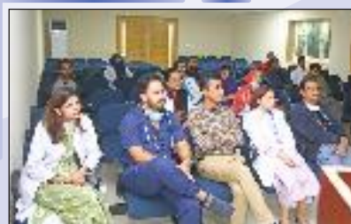
Chest Medicine Department Workshop