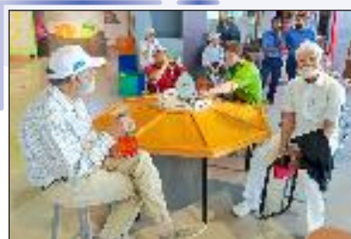
Elderly participants taking a well-deserved break, relaxing and enjoying a moment of rest between activities