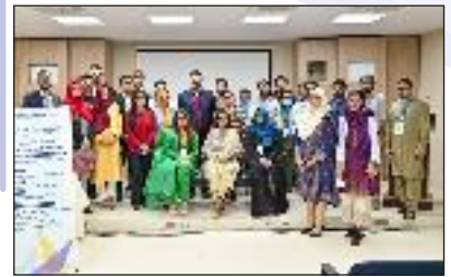
Infectious Diseases Session