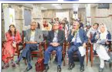
Community Medicine Session