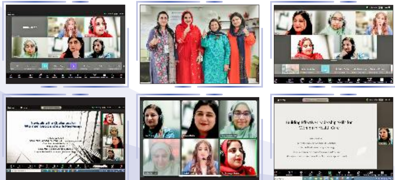
Webinar: Women Leadership in Healthcare