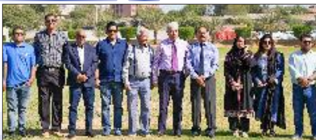
LNH Management with Honorable Guests