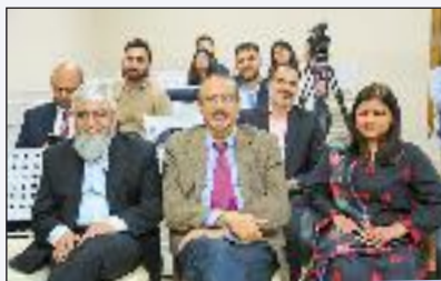
Plastic Surgery Session