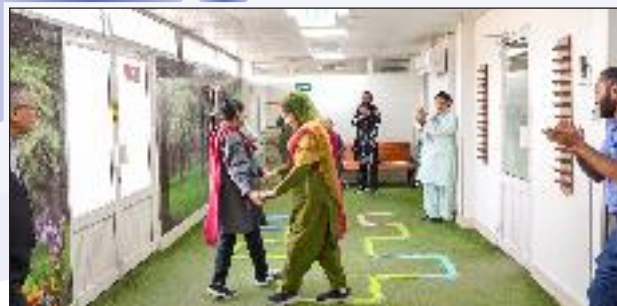
The female members helping each other in accomplishing the task while everyone cheers