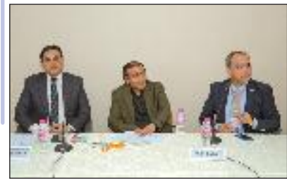
Cardiac Surgery Session