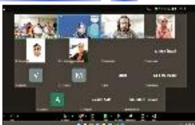
Histopathology Department Conducted an Online Workshop