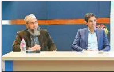
Orthopaedic Surgery Session