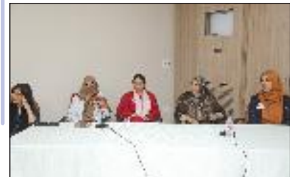
Breast Surgery Session