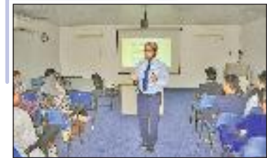
House Officers attending the CME

house officers, integrating empathy into your daily interactions can set the tone for compassionate, patient-centered care, ensuring that each individual feels valued and understood. Cultivating empathy not only elevates your practice but also strengthens the humanistic core of medicine.