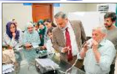
Hands-On Activity by Physiology Department