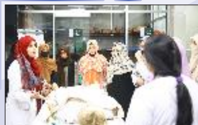
A Demonstration during Workshop by RSDC