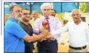
Medical Director awarding the trophy to the runners up team Press Media XI