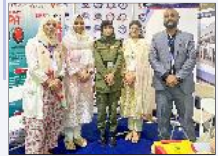
Team LNH at 21 st Health Asia 2024