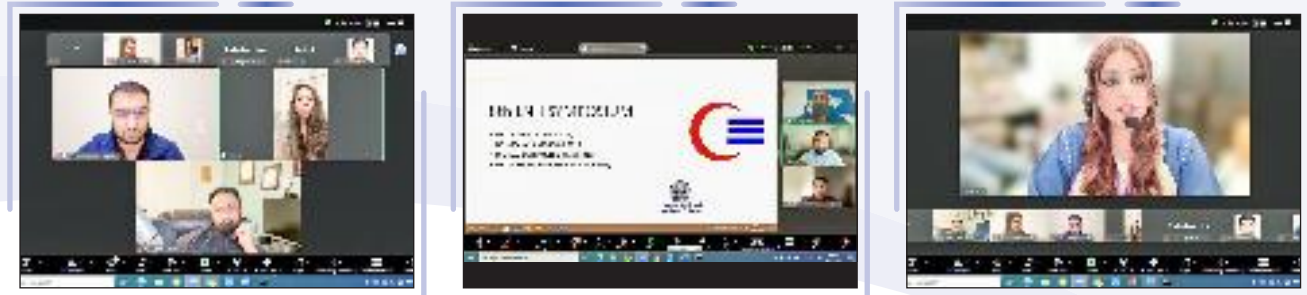
Webinar: Pathway to Medical Careers in the USA & UK

addressing concerns about exam preparation, clinical experience, research opportunities, residency match strategies, and work-life balance abroad. The success of this webinar reinforces the importance of alumni engagement in guiding future generations of medical professionals. Given the enthusiastic response and high demand, similar sessions will be planned in the future to further support and mentor aspiring doctors in their international career journeys.