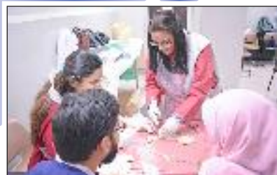
Activity during Paediatric Surgery Workshop