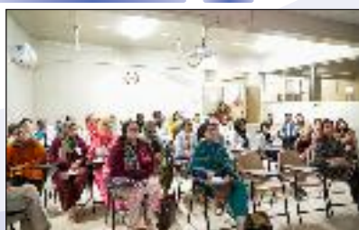
Attendees at General Surgery Workshop