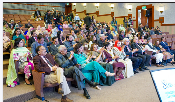
Inauguration Session in Progress

Liaquat National Hospital remains committed to supporting such dialogues and initiatives that foster progress in medical care, education, and research. The success of the LNH Symposium stands as a testament to the dedication and passion of everyone involved in creating positive change for the future of healthcare in Pakistan.