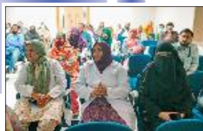
Participants at the Rheumatology Workshop