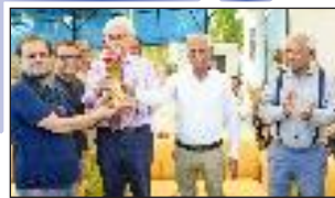
Medical Director awarding the trophy to the winning team LNH XI