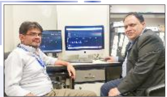
The Infrastructure Team had celebrated the successful completion of the project