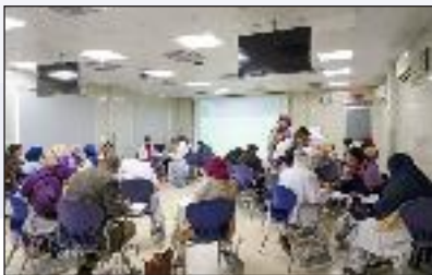
Workshop by Chemical Pathology Department