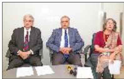
Chemical Pathology Session