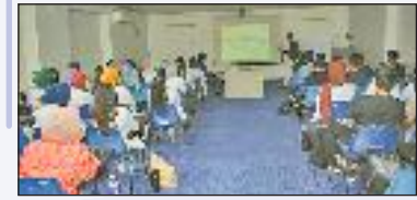
Participants of CME