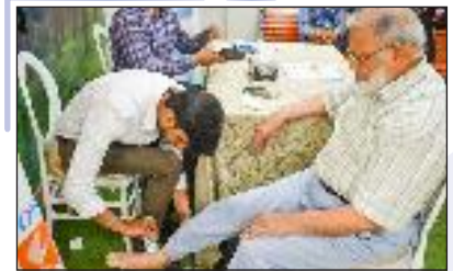
DXA Scanning for Geriatric Health Camp participants for comprehensive health diagnostics