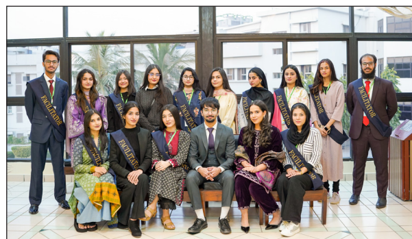
Facilitators for the Symposium