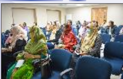
Participants at Workshop by Dermatology Department