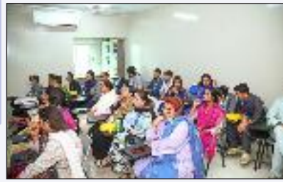
Admin Scientific Session