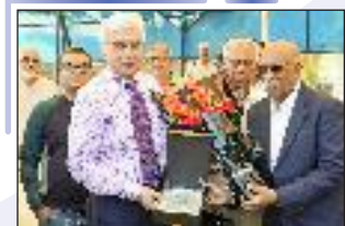
Medical Director presenting the souvenirs to the guests of honor