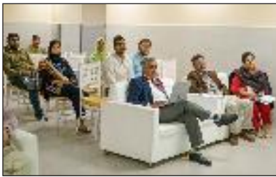
Molecular Pathology Session