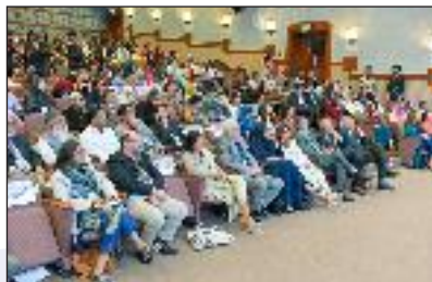
Attendees at Plenary Session