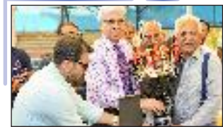
Medical Director presenting the souvenirs to the guest of honor