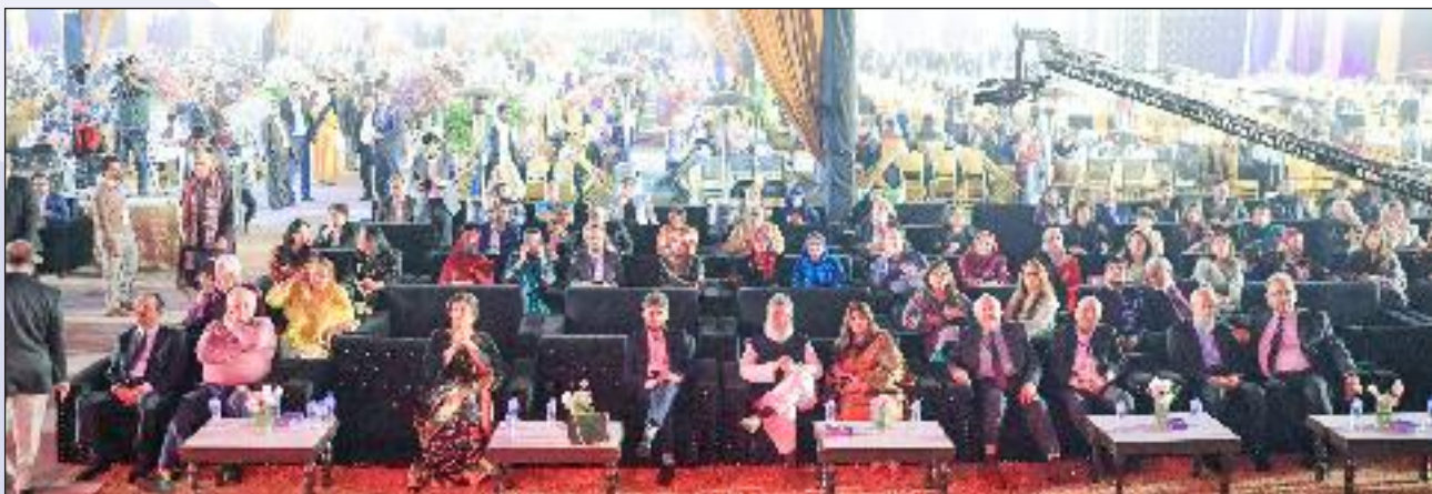
Glimpses from Banquet Dinner