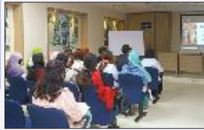
Audience Attending Workshop by Pharmacy Department