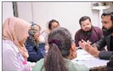
Group Discussion during Perioperative Arrhythmias Workshop