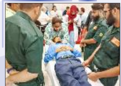
Primary Trauma Care workshop