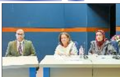
Paediatric Medicine Session

Digital learning and technology in medical education including e-learning platforms, virtual simulations, and AI-assisted training modules and modern pedagogical techniques were introduced to educators that can improve medical student