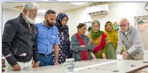
Engaging in the moment, as everyone shares in the warmth of the activity together