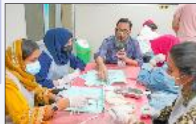
A Demonstration at the Workshop by Vascular Surgery Department

Improving skills in specialized medical areas such as Porta Cath access, medical communication, geriatric healthcare needs, antibiotic stewardship, POCUS in critical care, H-Pylori diagnostics, soft tissue