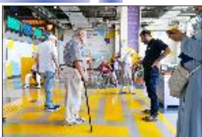
A facilitator guiding an elderly participant through a scientific maze, explaining each step with care and attention

Beyond learning, the trip provided a chance for the senior citizens to socialize and bond in a lively setting, fostering connections and shared experiences while enjoying a day filled with science and camaraderie.