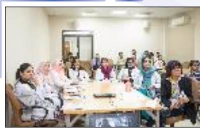
Attendees at the Internal Medicine Workshop