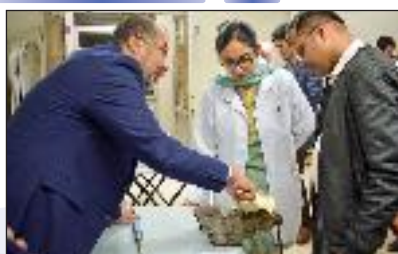
Demonstration at Neurosurgery Department