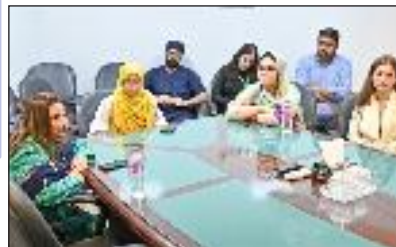
Meet the Expert Sessions at Oncology Department