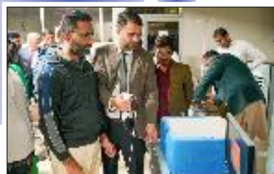
Urology Workshop on RIRS in Progress