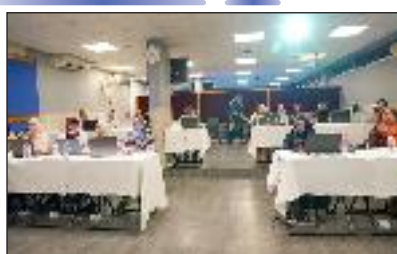
Participants at Biochemistry Department Workshop