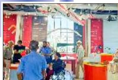
SCPCU members attentively listening and watching a scientific demonstration as a facilitator explains the concept with engaging visuals