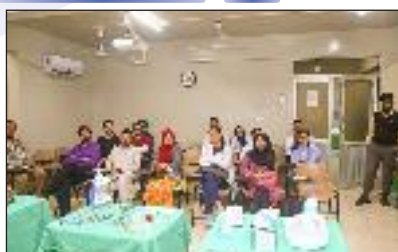
Thoracic Surgery Department Organized a Workshop

Online workshops for international participants on geriatric 5Ms essentials, artificial intelligence in primary care, and motivational interviewing techniques for lifestyle management via Zoom utilized an engaging format along with Breakout room activities.