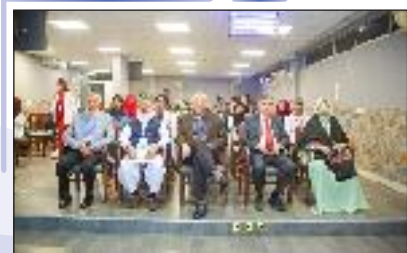
Internal Medicine Session