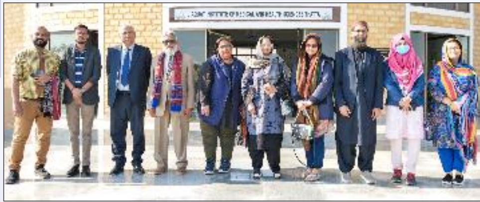
LNH Instructors Conducted a Workshop at LUMHS in Thatta

(Emergency Medical Technicians), Students, and healthcare professionals from both public and private sectors participated. Certificates and Ajraks were presented to faculty members and assistant instructors at the end as a token of appreciation.