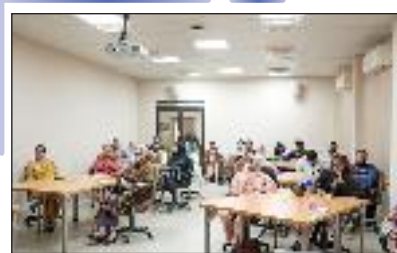
Journal Selection Workshop by Publication Department